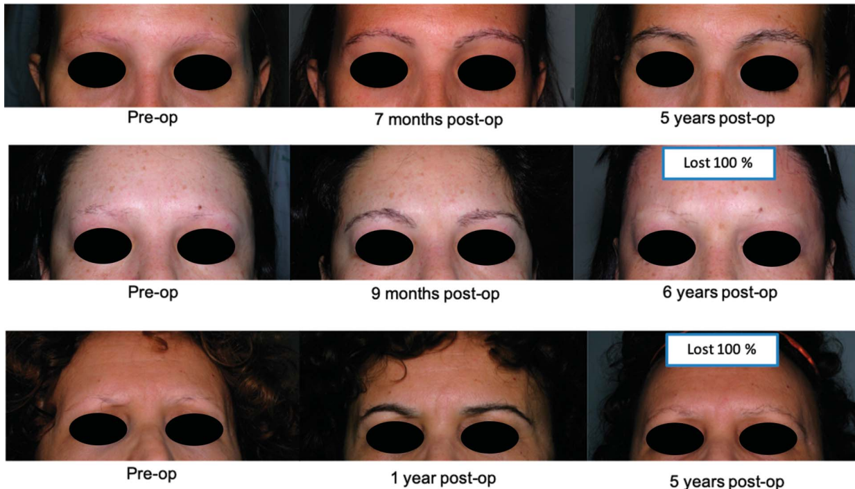
Figure 2. Short- and long-term results of hair graft transplantation in the eyebrows of FFA patients. Representative images of 3 patients suffering from FFA treated with hair transplantation. Top: A patient was transplanted with 295 hair grafts in the eyebrow area. Seven months after the procedure, the patient had lost ~10% of transplanted hair grafts and after 5 years retained ~80% of hair grafts. Middle: 390 hair grafts were transplanted, and after a 9-month follow-up, all transplanted hair grafts had been retained. However, after 6 years, all hair grafts had been lost. Bottom: 1 year after transplantation of 256 hairs, the patient had retained all grafts. However, after 5 years, all transplanted hair grafts had been lost. FFA, frontal fibrosing alopecia.

transplanted eyebrow hairs in a slow but progressive manner (Figure 2). Only 1 patient was considered to have a good long-term outcome after 4 years (Figures 2 and 3). Interestingly, some patients, despite the long-term failure, were so satisfied with the short-term results that they opted to have another hair transplant session than another form of therapy (e.g., tattooing). One patient was diagnosed with breast cancer, treated with chemotherapy and lost all body hair including transplanted eyebrows. Overall, short- and long-term outcomes were similar in most patients, retaining transplanted hair grafts in the short term and losing them in the long term (Figure 3).