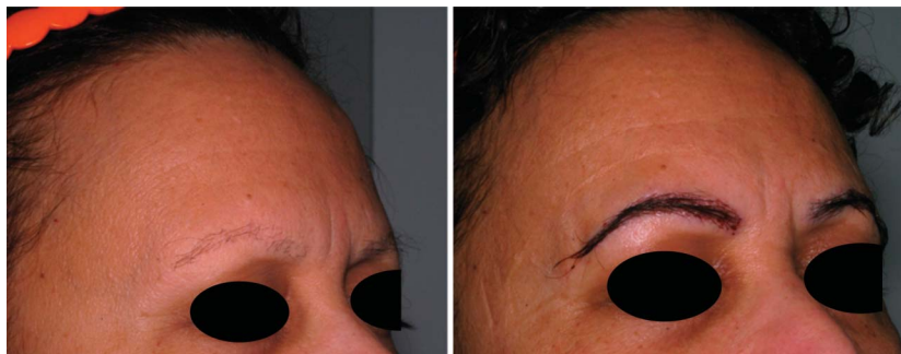
Figure 1. Eyebrow hair transplantation in FFA patients. Eyebrow hair transplantation of an FFA patient suffering from complete eyebrow loss (left) before and immediately 24 hours after (right) the procedure. Hair grafts were harvested from the occipital scalp followed by implantation of single hair follicle grafts with implanters into the eyebrows. FFA, frontal fibrosing alopecia.

A total of 8 of the 10 patients achieved what was considered normal (80%–100%) hair growth at 6 to 12 months after transplantation, whereas 2 patients had initially unsatisfactory (50%–60%) hair growth at their 6- to 12-month follow-up (Figure 2). Of those 8 patients with an initial satisfactory growth, all kept most of their transplanted hairs up to 24 months after the procedure. Of the 8 patients who responded satisfactorily, 4 could be followed up for more than 3 years. Of these 4 patients, 3 began to lose the